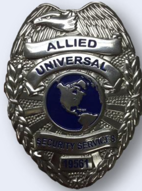
ALLIED UNIVERSAL STANDARD BADGE