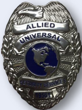
ALLIED UNIVERSAL STANDARD BADGE