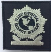
NEW YORK BADGE PATCH