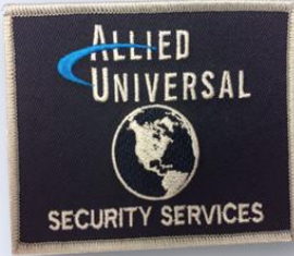
NEW YORK PATCH