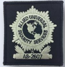
CONNECTICUT BADGE PATCH