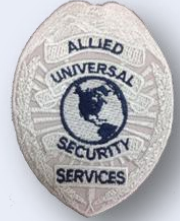
STANDARD BADGE PATCH